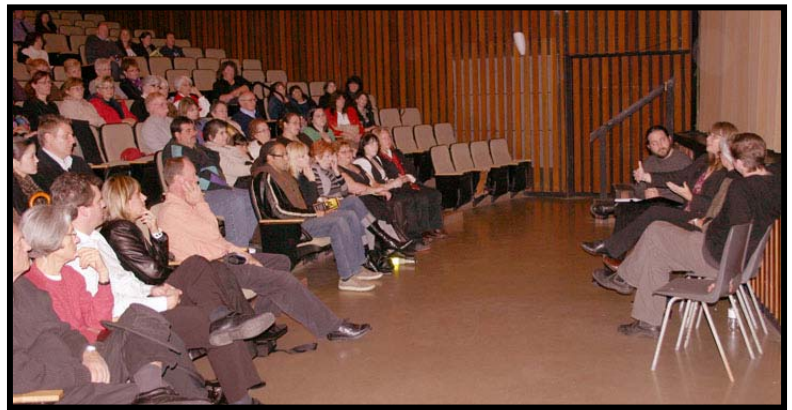
Artists Chat (In Good Company / Autism Ontario), Nov. 15/08