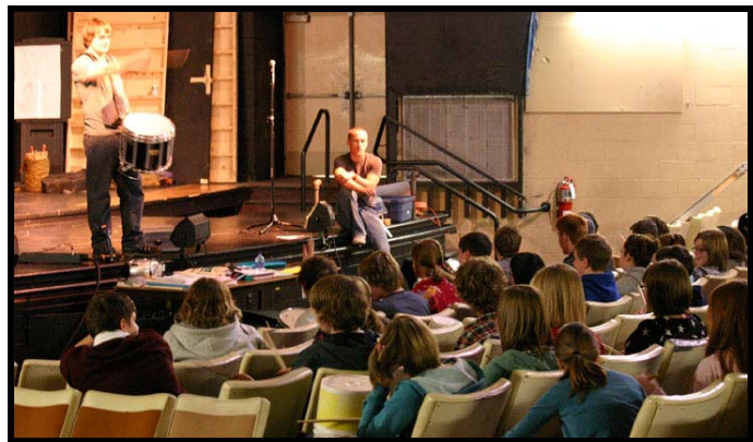
Workshop with Squid Precision Drummers at Laura Secord, Nov. 18/08

The Squid Precision Drumming artists conducted a 90 minute workshop for the 'junk band' at Laura Secord Secondary School about the importance of teamwork, practice and dedication, and being proud of your talents. The artists also did some hands-on group work with different sections of the 'junk band'.