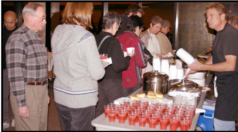
Pre-show Dinner, Nov. 22/09

masterclasses with local, experienced dancers; educational workshops (3 elementary, 1 high school, 2 university) that focused on Aboriginal dance styles and their context within Aboriginal culture and Smith's own contemporary interpretations of the dances. On November 11/08 the Centre hosted a pre-show dinner with patrons and members of Brock's Aboriginal Student Services (BASS), which included drumming and storytelling, opportunities for discussion and promoting cultural awareness of Aboriginal cultures. The Centre and BASS partnered with a local restaurant to provide complimentary meal consisting of Indian tacos, corn soup and strawberry drink.