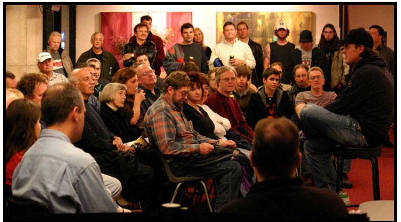
Artist Chat with Joe Bonamassa, Oct. 30/08