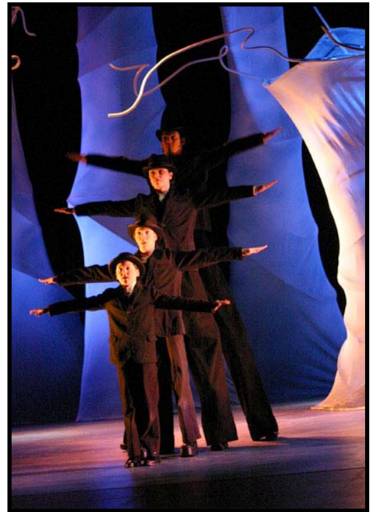
Sursaut Dance Theatre: At Nightfall , Jan. 15/09

"As a small school with limited funds, we appreciate any support in providing our students with authentic experiences in and with the arts. Students who become critical audience members gain skill in both artistic creation and performance and in critical thinking across the curriculum."